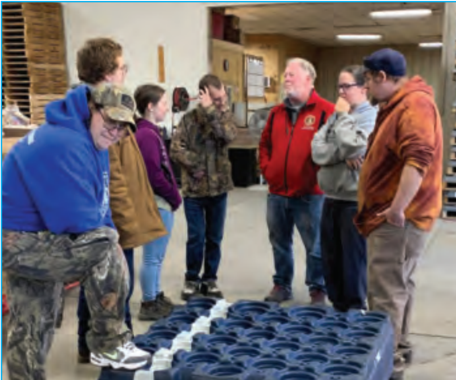
Workshop services include contracts with individual businesses which include everything from small local firms to national corporations.

It’s a formula that is a proven winner for Missouri and Missourians.